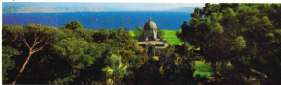
Mount of Beatitudes

© Published by Palphot Ltd. Printed in Israel www.palphot.com Photography by: Goro Naibandian